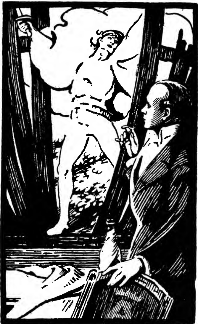
IN THE DARK ENTRANCE THERE APPEARED A FLAMING FIGURE